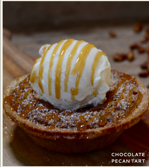
CHOCOLATE PECAN TART